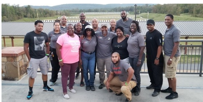
Bass Reeves Gun Club Competitive Shooting Team